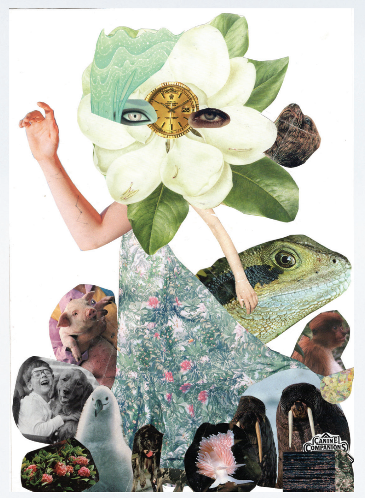
Collage made by Year 7 student during a climate change workshop: 'We are running out of time to take climate action'

As a result, families and community groups can differ in their attitudes towards climate change and its effects, putting teachers and students in a difficult position.